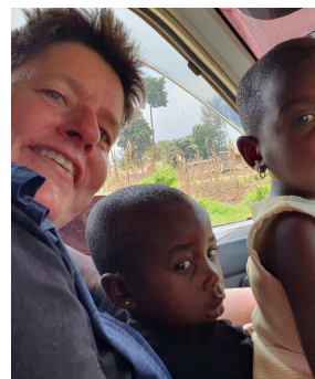
Tanja Gagg Events