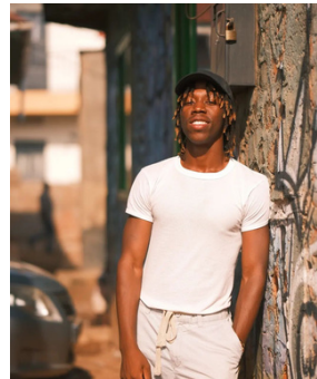
Apollo Dance Teacher